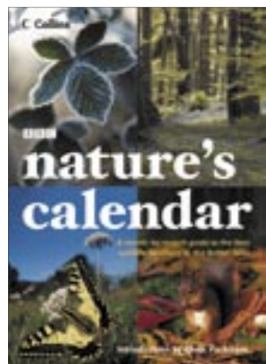
Nature's Calendar introduction by Chris Packham Collins, hb, pp256, £17.99

Published to coincide with the television series of the same name, Nature's Calendar would make an excellent investment for any budding amateur naturalist. Broken down into a month-by-month digest, the book is packed full of hints and tips on how to get the best out of your local wilderness areas, providing detailed directions, weblinks and opening hours for each of the 120 UK-wide locations featured within.